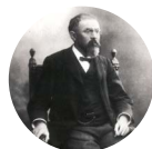
Jules Henri Poincaré 1854-1912

French chemist and physicist. He is known mostly for his discoveries on gas characteristics.