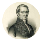
Louis-Joseph Gay-Lussac 1778-1850